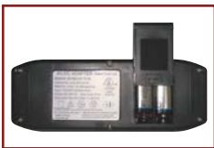
Battery Backup System

Sizes may vary depending on fabric, filling material, upholstery and carpet thickness. All measurements taken on concrete floor using levels and metal rulers.