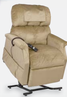
Comforter Small PR-501S