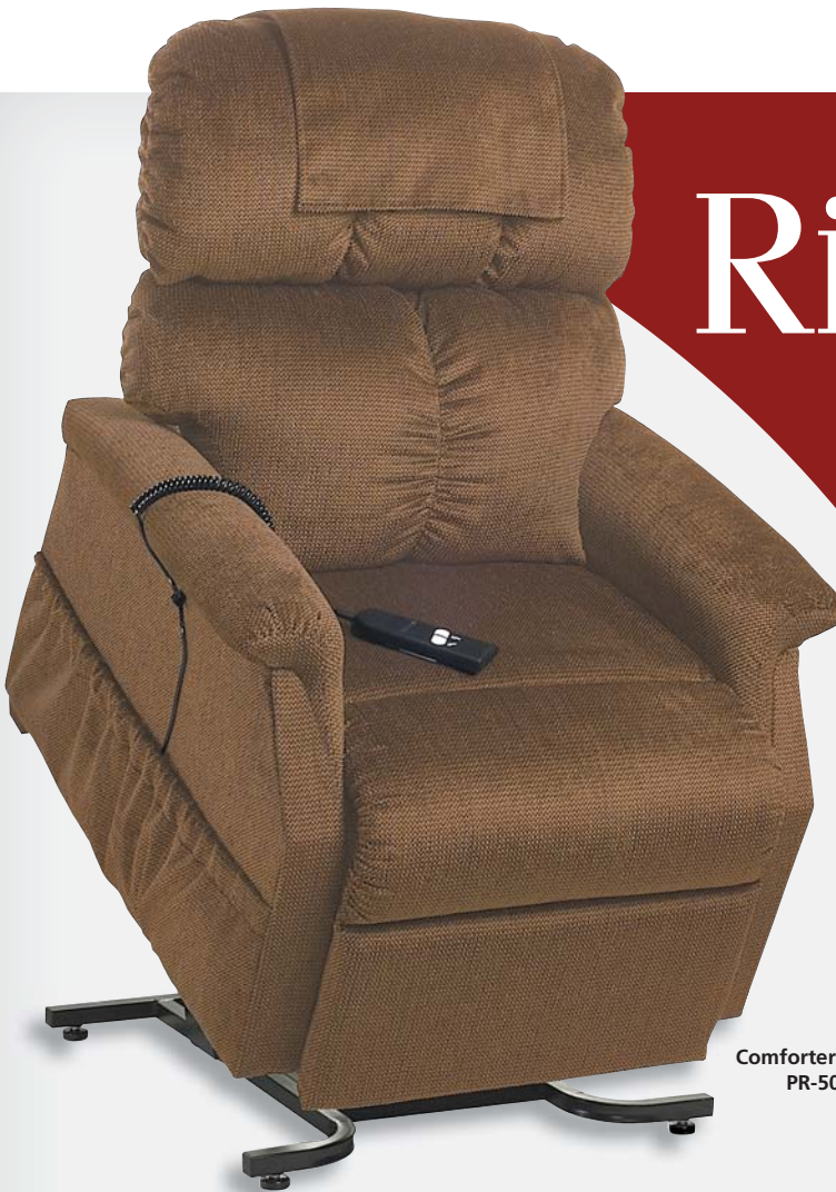
Comforter Medium PR-501M