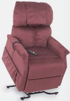
Comforter Tall PR-501T