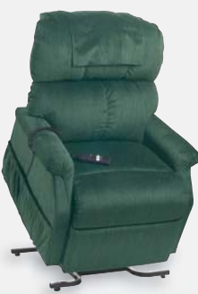
Comforter Large PR-501L