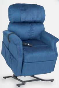
Comforter Junior Petite PR-501JP