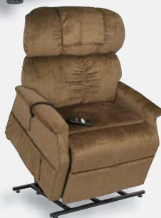
Comforter Medium Wide PR-501M-26D