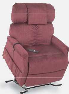
Comforter Large Wide PR-501L-26D