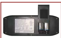
Battery Backup System

Our luxury lift & recliners are equipped with electronics able to assure a secure lift every time you need it.