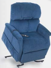
Comforter Small Wide PR-501S-23