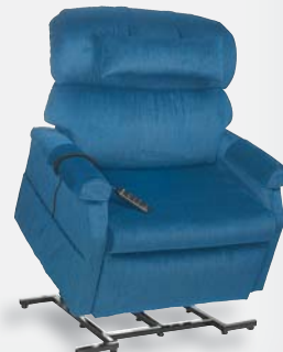
Comforter Super 33 Wide PR-502