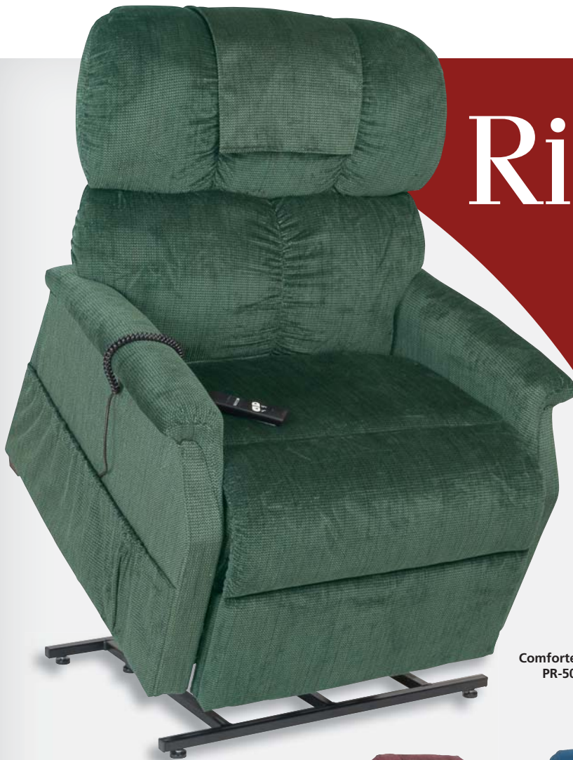
Comforter Tall Wide PR-501T-28D