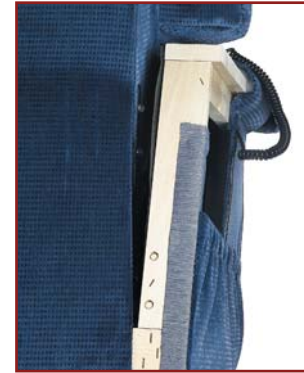
501 M shown