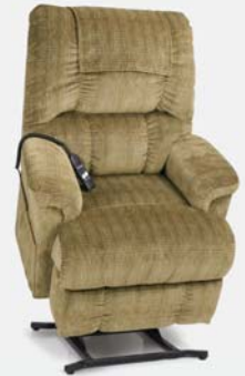
Space Saver PR-906