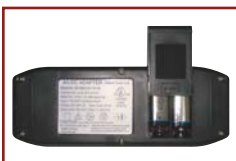
Battery Backup System

Sizes may vary depending on fabric, filling material, upholstery and carpet thickness. All measurements taken on concrete floor using levels and metal rulers.